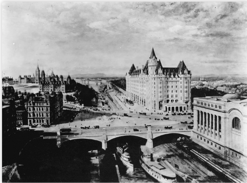
Union Station, Château Laurier and the old post office, 1911