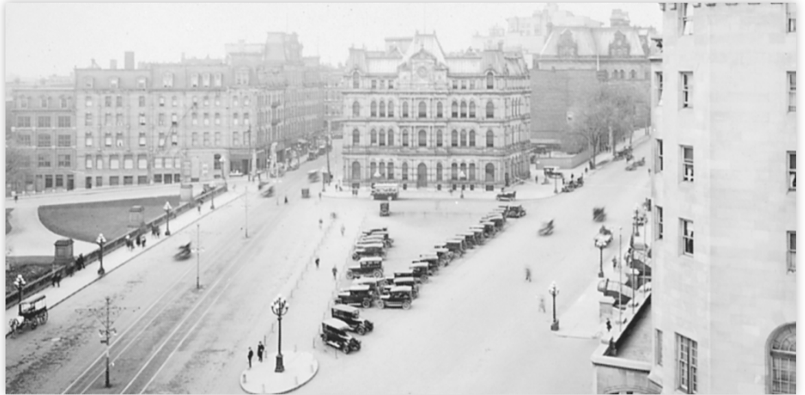
Confederation Square, 1930