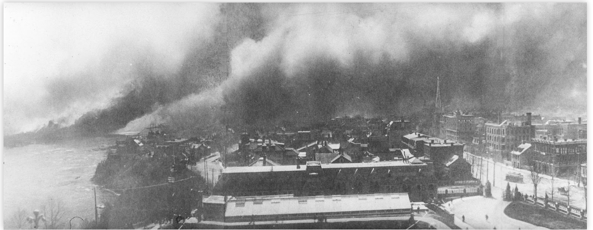
Second Great Fire of Ottawa-Hull, February 4th, 1916