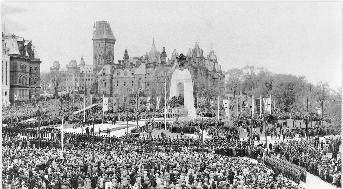
H.M. King George VI and Queen Elizabeth unveil the War Memorial, 19 May 1939