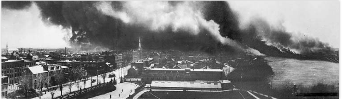
Great Fire of Ottawa, 1900